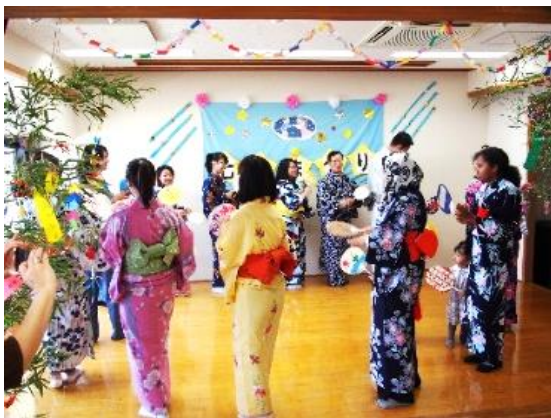
Introduction to Japanese events and culture

The Japanese Learners' Room also has a variety of events in addition to Japanese studies.